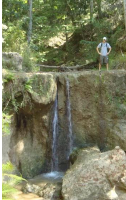
Osmunda regalis , Royal Fern very common in Louisiana