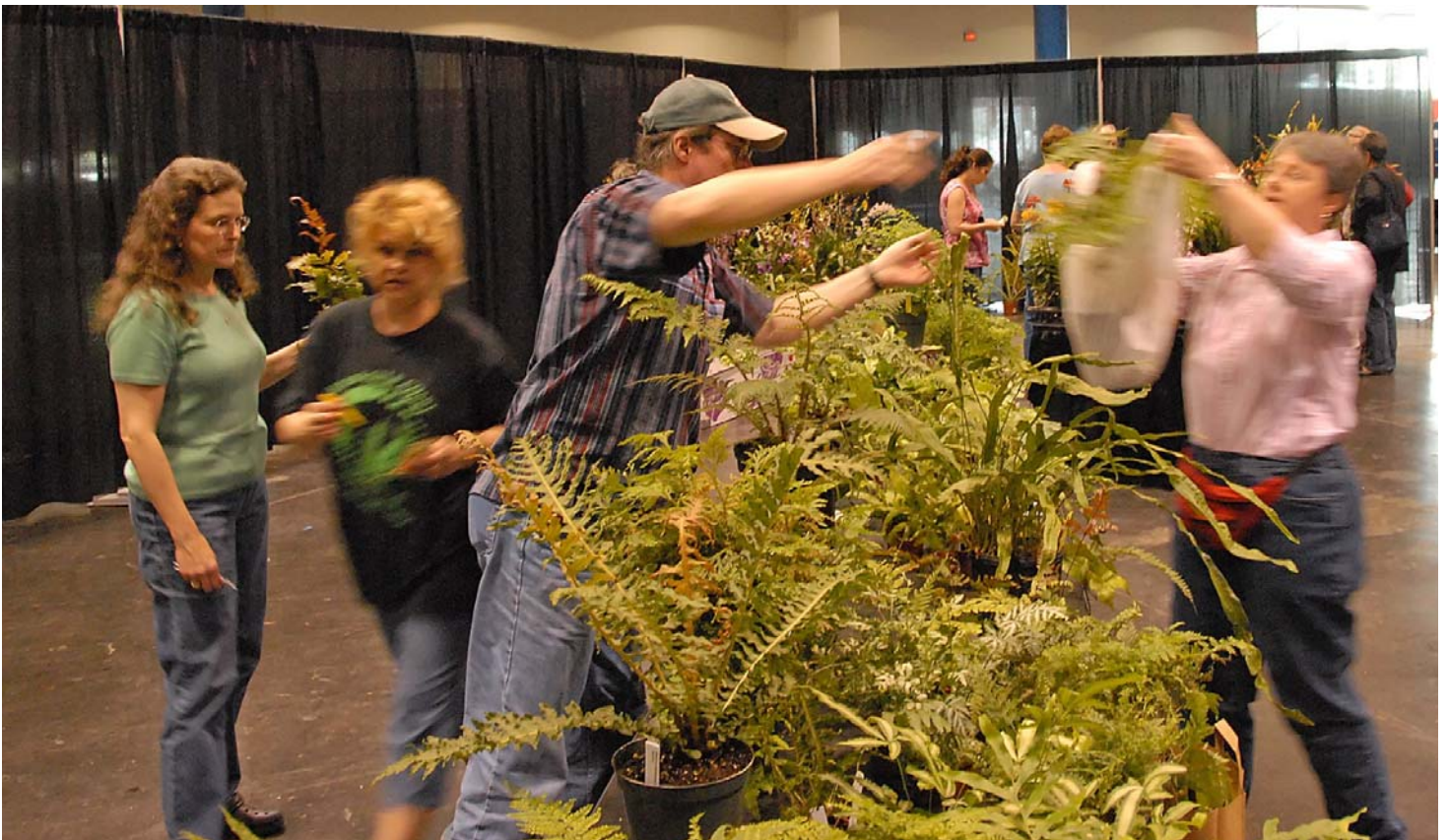
Working Hard and Fast