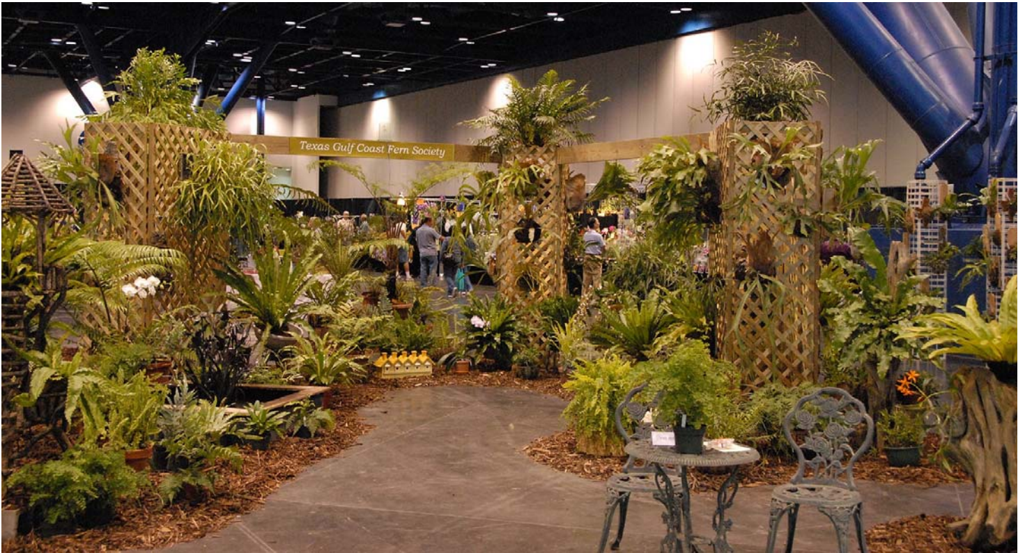
Texas Gulf Coast Fern Society Display – We won First Prize!!!!